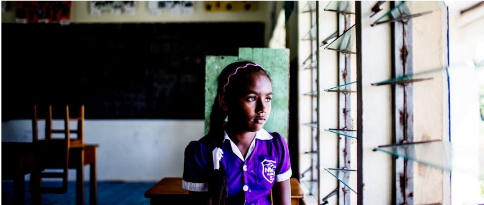
Naidiri Primary School