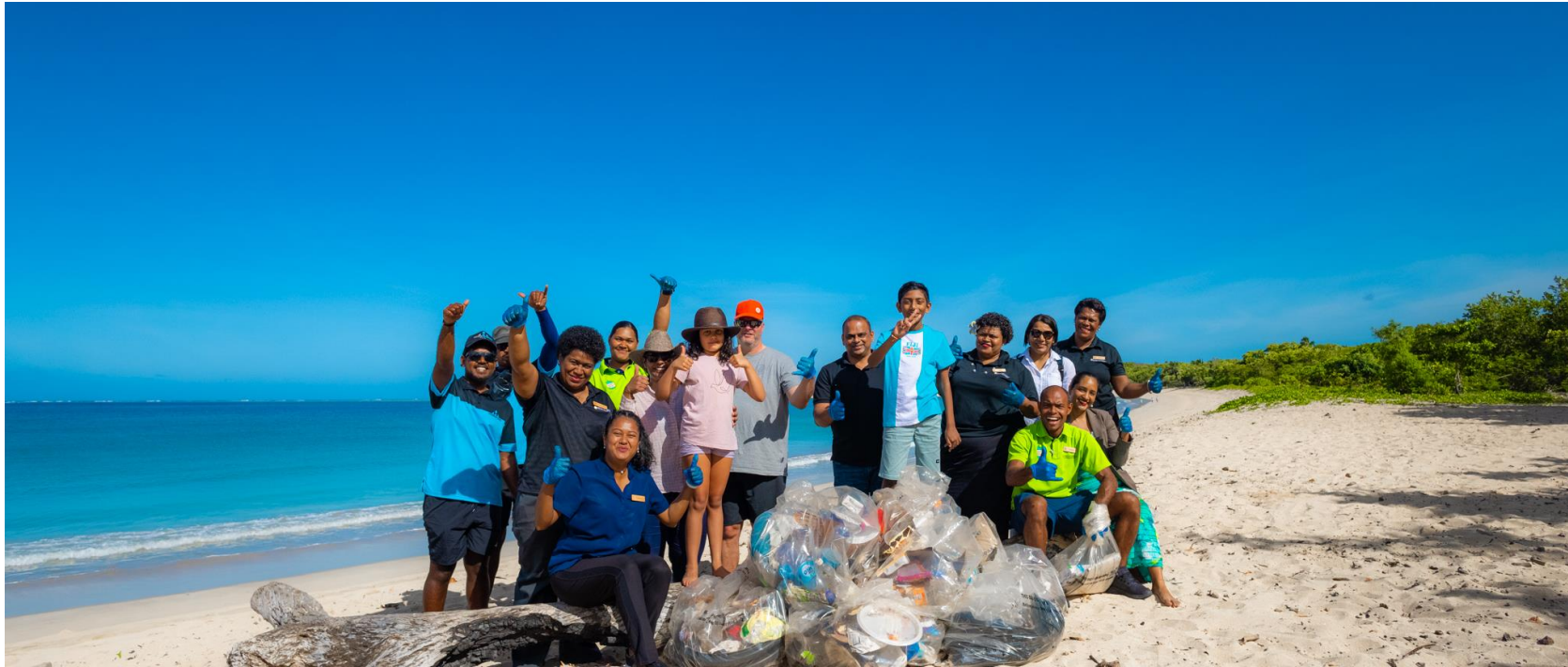
InterContinental Fiji Golf Resort & Spa